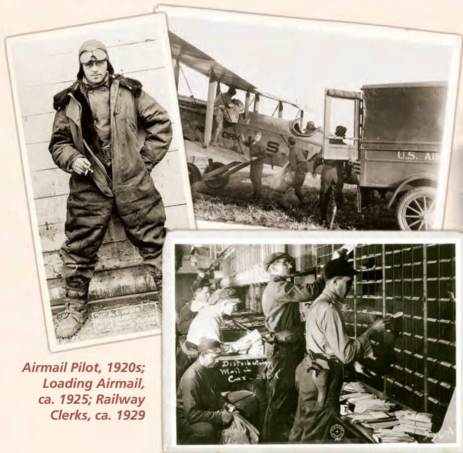
Airmail Pilot, 1920s; Loading Airmail, ca. 1925; Railway Clerks, ca. 1929