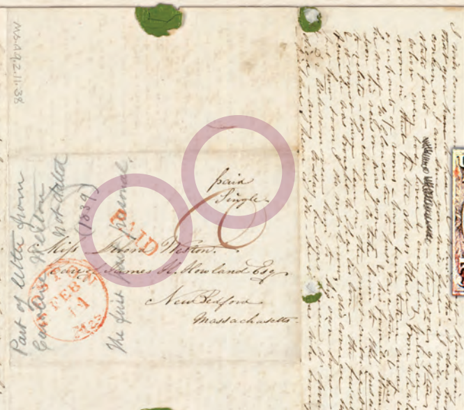
Letter marked “PAID,” 1839; Franklin and Washington stamps, 1847; Elvis stamp, 1993