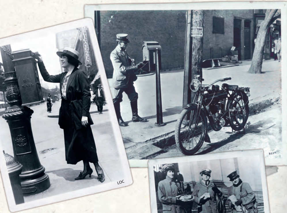
City Mailbox, 1920s; Motorcycle Mail, ca. 1911; City Carriers, 1917