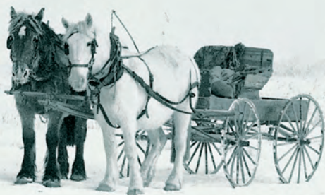
Cover and inside front cover images courtesy of Library of Congress (LOC).