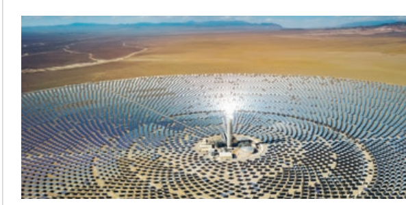
Above: The Crescent Dunes Solar Energy Project, north of Tonopah.

Tonopah's elevation attracts amateur astronomers to the town's stargazing park , and the region is recognized as one of the country's best sites in the U.S. to view the cosmos.